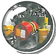
Grease Trap 隔油池