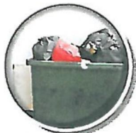
Garbage Room 垃圾房

據記者報導，香港某家幼兒園附近的垃圾房衛生情況十分糟糕，老鼠、蟑螂到處亂竄，蒼蠅和蚊子到處飛，並發出陣陣惡臭，嚴重影響公眾健康。一名幼兒園男童還說：“上課時，課堂裏經常可以嗅到垃圾房傳來的臭味”。