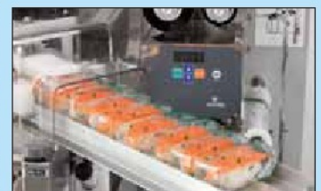
Wrapped sushi comes out automatically.