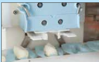
Rice dividing and 1st forming