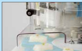
2nd forming (wasabi for option)