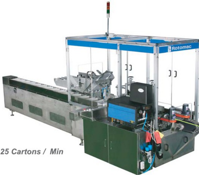
25 Cartons / Min