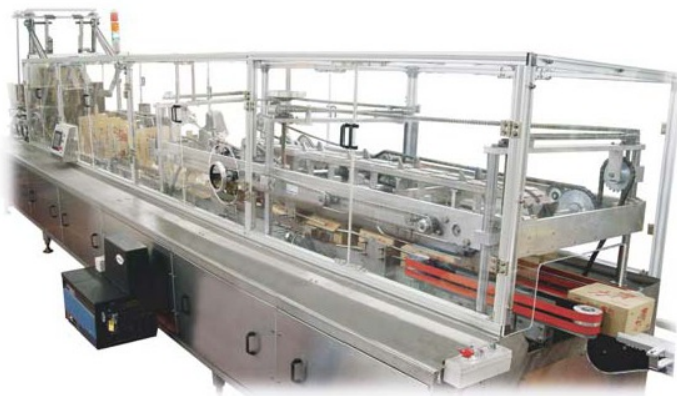
70 Cartons / Min