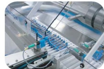
Photo eye sensor for precise timing for putting products into receiving buckets