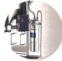
(As per our specifications)

A specialized water filter can now be installed directly to the washing machine as an option.