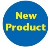
Table-Top Nori-Maki Machine SVR-NXA