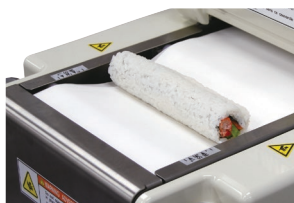
6. Forms beautiful rolls