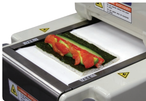
3. Place ingredients by hand