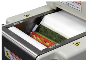
4. It starts rolling