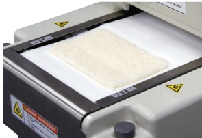
1. It spreads sushi rice onto the forming sheet