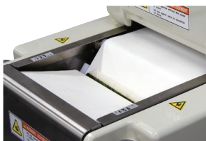
5. Automatically roll up