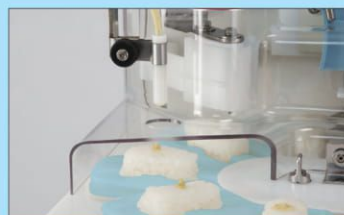
2nd forming (wasabi for option)