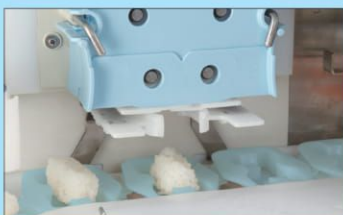
Rice dividing and 1st forming