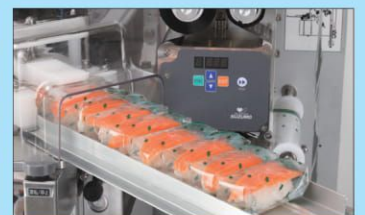
Wrapped sushi comes out automatically.